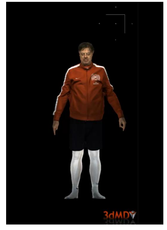
3dMDbody10.r image sequence with color texture